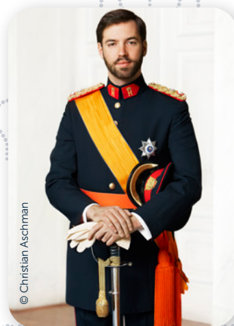
HRH Grand Duke Guillaume