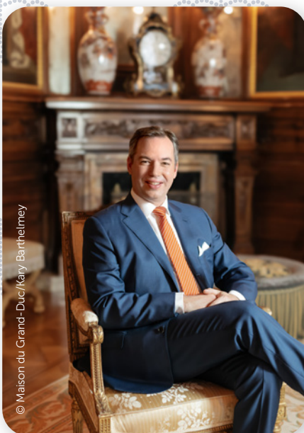
HRH Grand Duke Guillaume