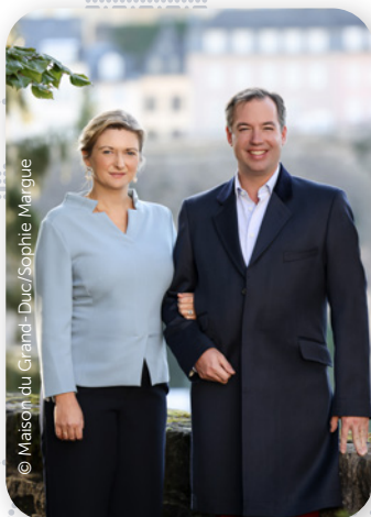
TRH the Grand Duke and the Grand Duchess