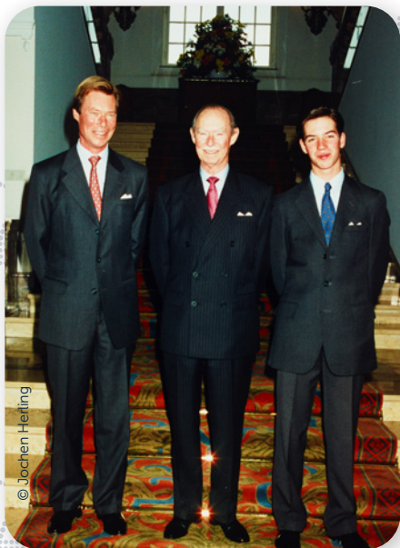
TRH Grand Duke Guillaume (on the right), accompanied by his father, Grand Duke Henri (on the left), and his grandfather, Grand Duke Jean (in the middle)