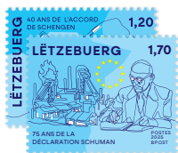
Special series Construction of Europe