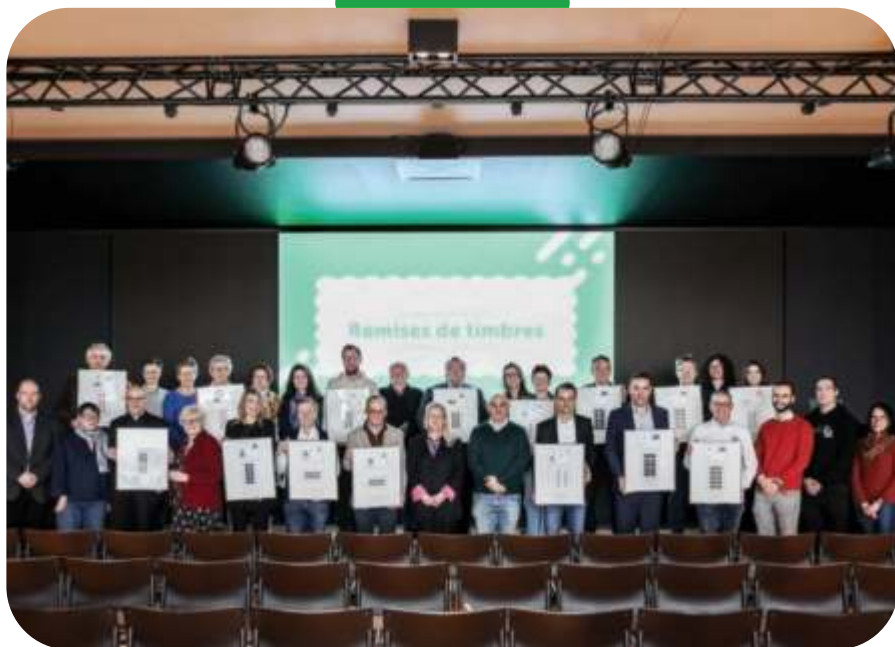
The stamps of the March issue were presented at HELIX on March 10.