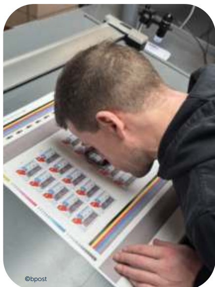
A color check is carried out on the printing press to ensure that the colours of the project are reproduced consistently on the stamp.