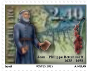
Special stamp Commemorating Father Bettendorff