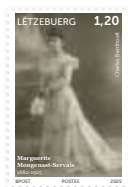
Special stamp Commemorating Marguerite Mongenast-Servais