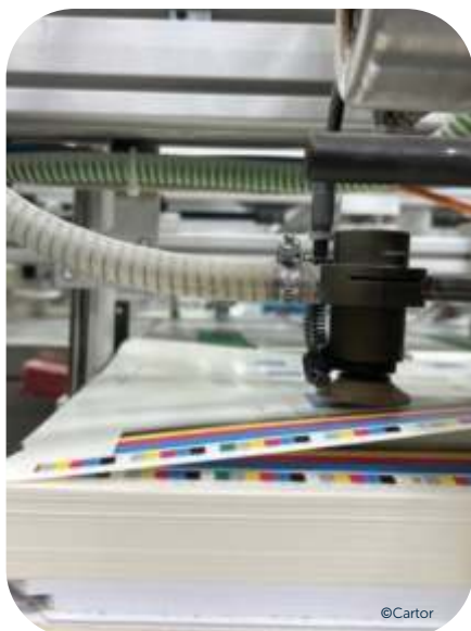
A special machine is used to precisely perforate the stamps.