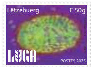
Special stamp LUGA – Luxembourg Urban Garden