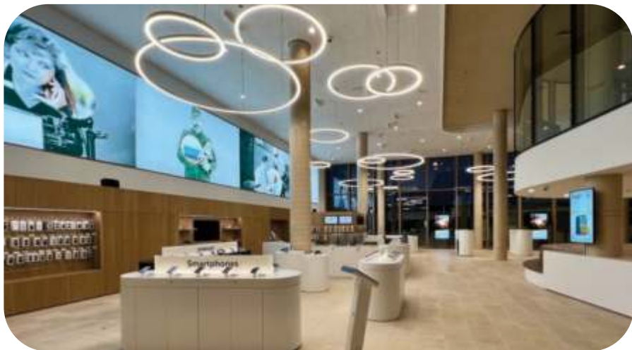
The Philatelic Counter is now located at the Espace POST Luxembourg-Gare.

How can we offer our customers of the Philatelic Counter an even better service while also integrating POST Philately's administration and logistics into an appropriate, modern and better-structured environment? The answer to this question was simple: relocation.