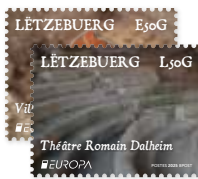
Special series EUROPA - National archaeological discoveries