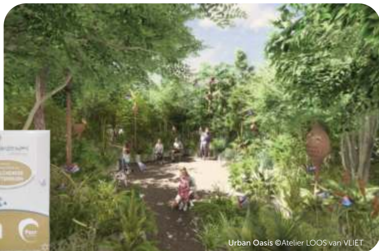
Urban Oasis ©Atelier LOOS van VLIET